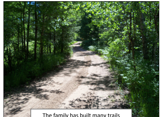
The family has built many trails

The almost 108 acre property is in the Pine River Watershed and protects a critical component of a wildlife corridor connecting the Pine River Valley with a large tract of private land along a creek. The creek is in a natural wetlands and is an important link to the Pine River. The property will help support wildlife habitat links and protected wetland ecosystems across property boundaries. Most nearby parcels have been converted to agricultural acres or rural residences, making this wildlife corridor and preserved wetland even more critical to wildlife and water quality.