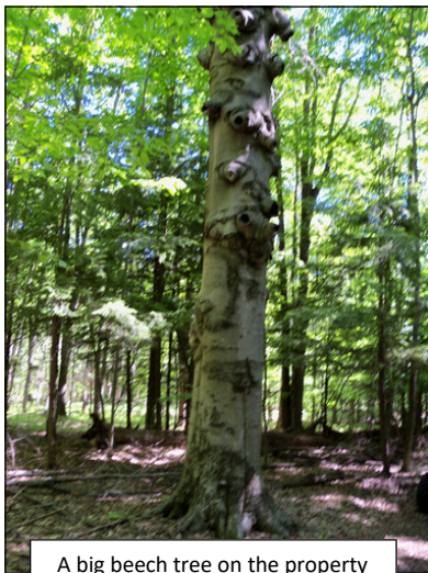
A big beech tree on the property

Although conservation easements are often similar—wooded areas with wildlife and water features—the CALC board works hard to accommodate the particular needs and wishes of each easement holder. The last easement of 2017 belongs to a family wishing to remain “under the radar.” So we’ll tell you about the property and its conservation values without revealing its exact location. As in all cases, property under a conservation easement is private property and does not give public access.