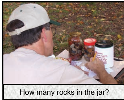
How many rocks in the jar?