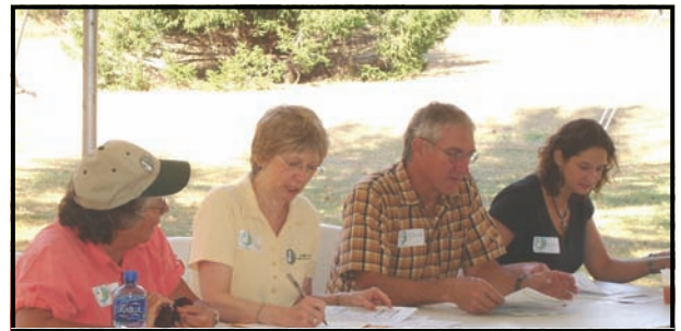
Your CALC Board at work.