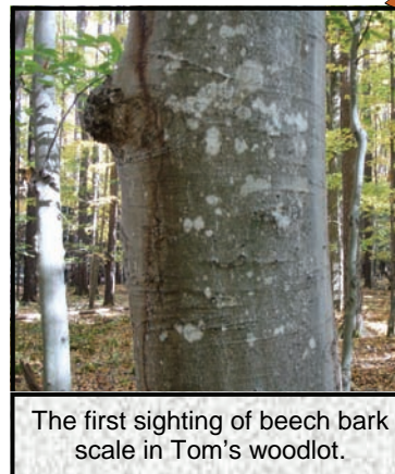
The first sighting of beech bark scale in Tom's woodlot.