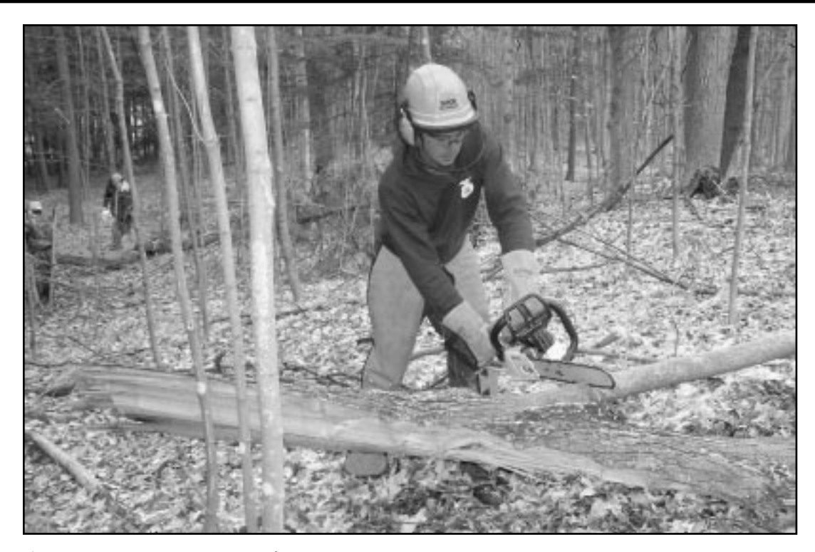
This downed tree has to go!