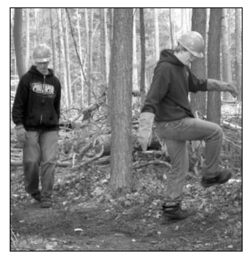
Kicking around on Waldeck Island.

During the course of the year students in the Agriscience program complete a diverse curriculum that includes: chainsaw, wood splitter, sawmill, tractor & log-skidder safety, aquaculture, water quality, poultry production, greenhouse management, soil science, forestry management, landscaping and floral design. 🔊