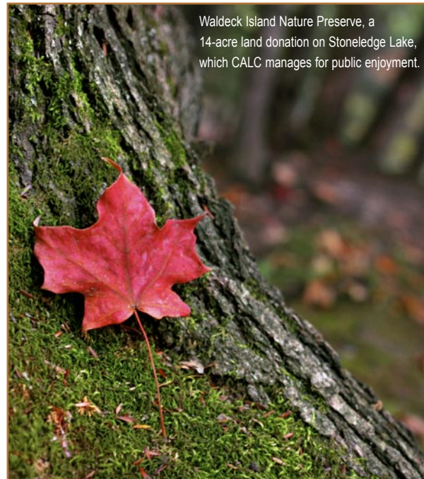
Waldeck Island Nature Preserve, a 14-acre land donation on Stoneledge Lake, which CALC manages for public enjoyment.